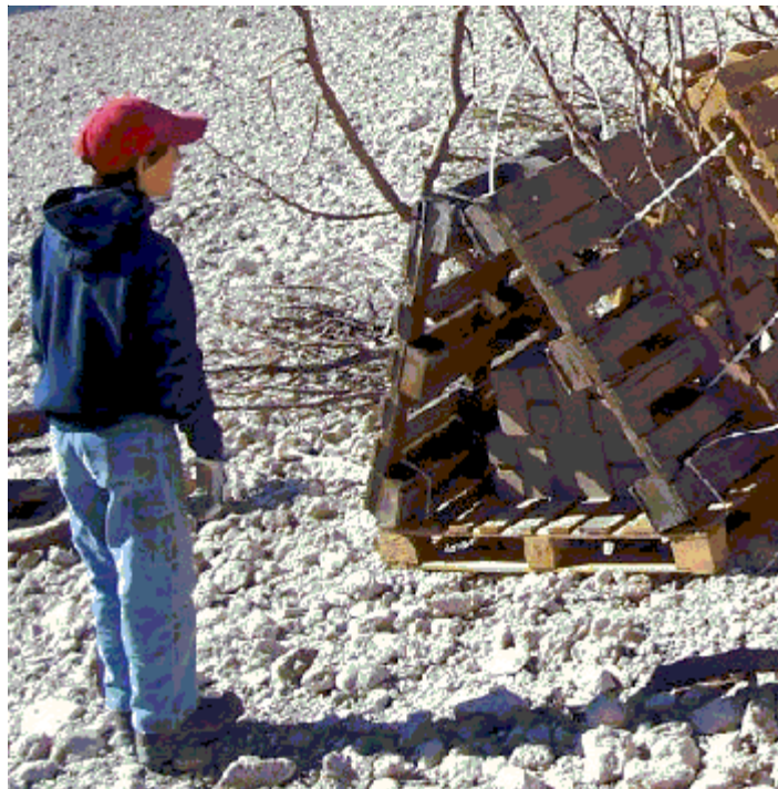
A young flycaster admires the work done by Project volunteers on a trout habitat structure.

I first worked on Sheep Shelf area right across from the marina. That's where Scott Dennis and I caught a bunch of fish one breezy day a few years ago. The extra rocky under shore gave the fish the natural habitat to thrive. Aligning the new A-frame structures next to the natural cover will extend the range in which the fish will thrive. We also worked the shelf just before Turtle Island.