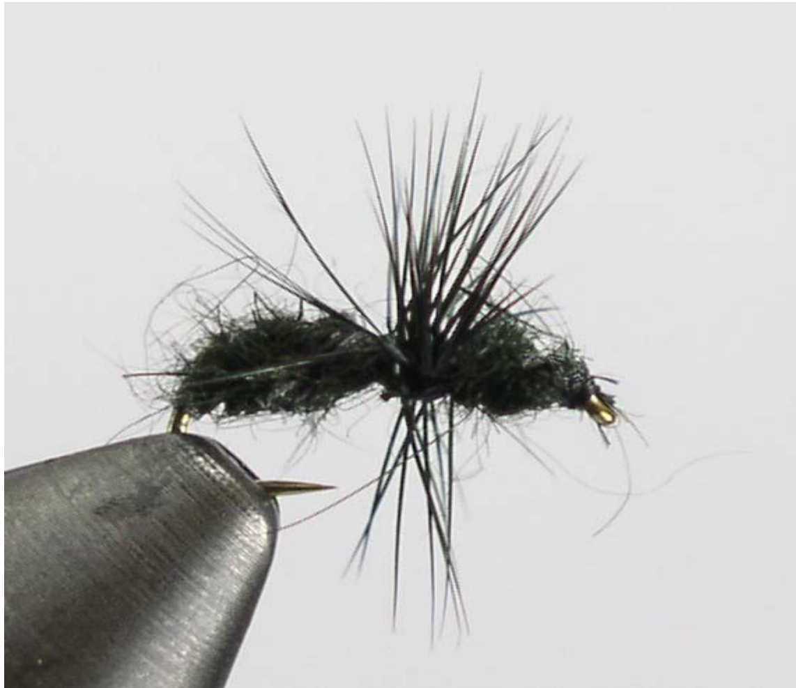
Black Ant Bernie Blakley