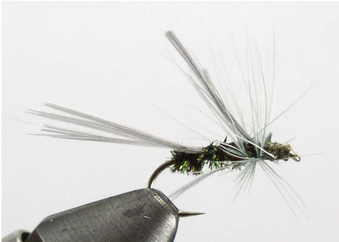
Blue Wing Olive Edd Cason