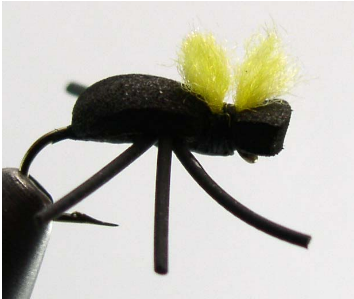
Morris Foam Beetle Sara Yeager