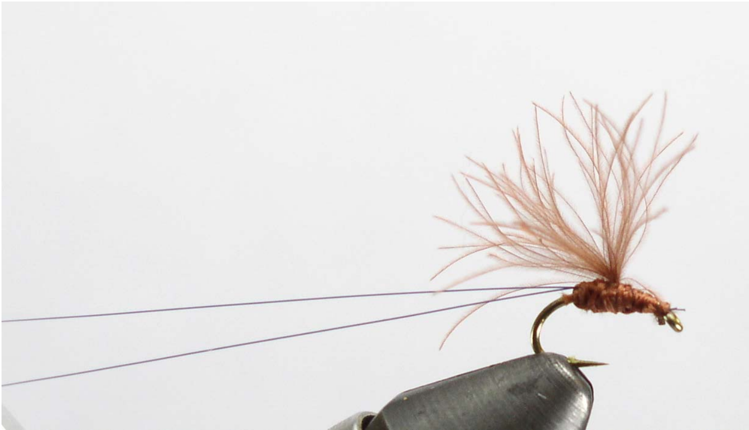
CDC Wing RS2 Doug Collier