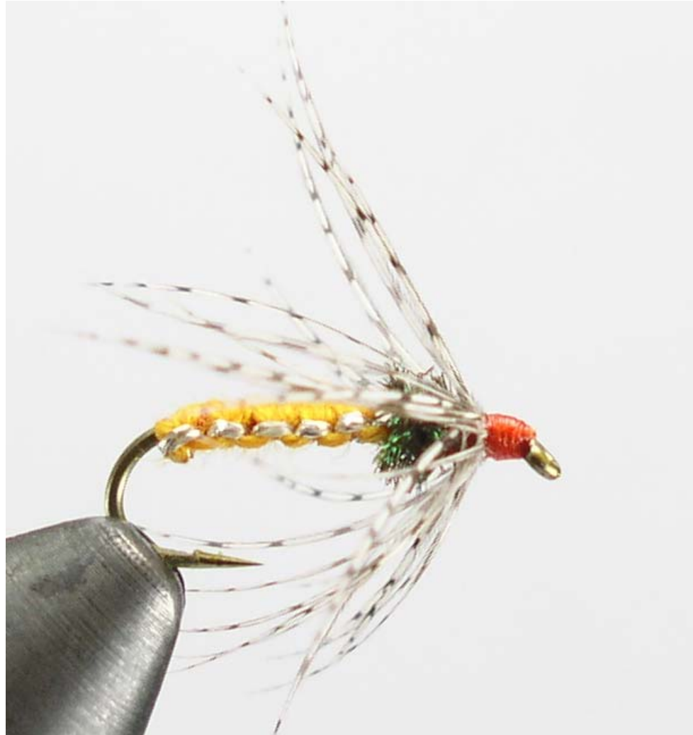
Orange Soft Hackle Nymph LeRoy Donnally