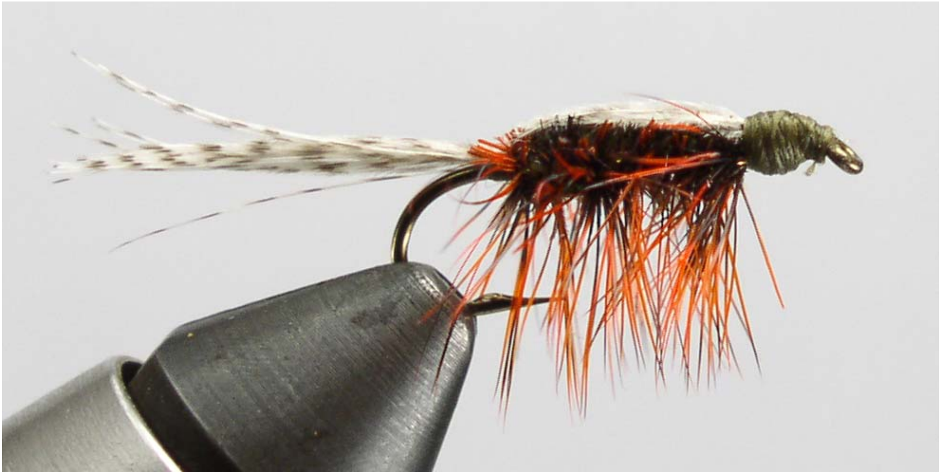
Peacock Callibaetis Elsie Ferguson